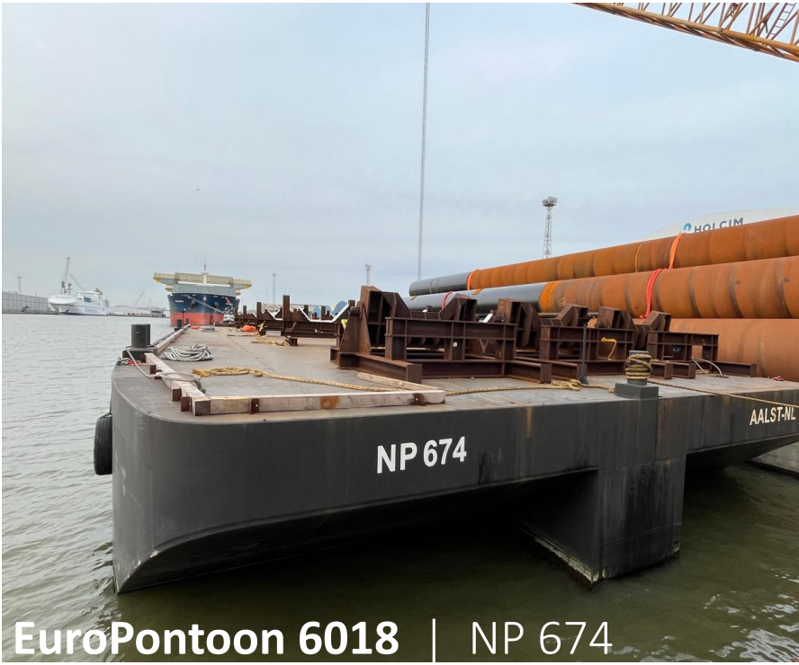
EuroPontoon 6018 | NP 674