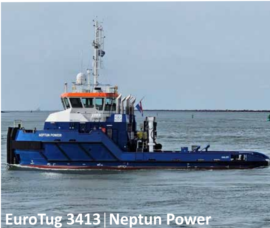
EuroTug 3413 | Neptun Power

The robust, efficient and flexible design of the AH Tug makes it one of the best vessels for anchor handling, dredging support and long distance towages. The AH Tug can be adapted to perfectly fit any project within a short time.