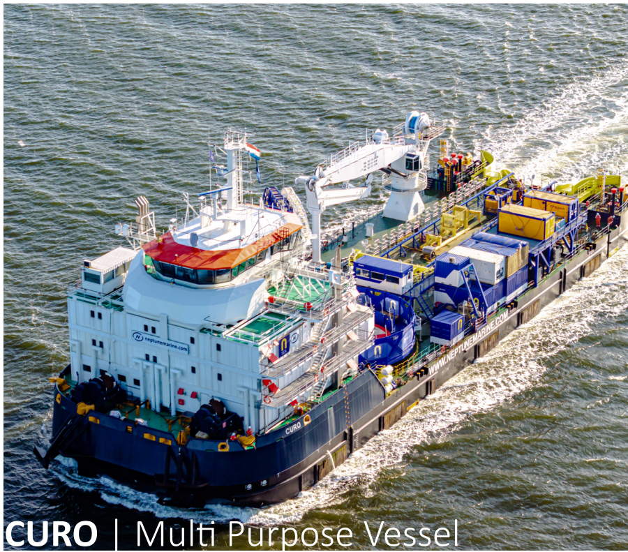
CURO | Multi Purpose Vessel