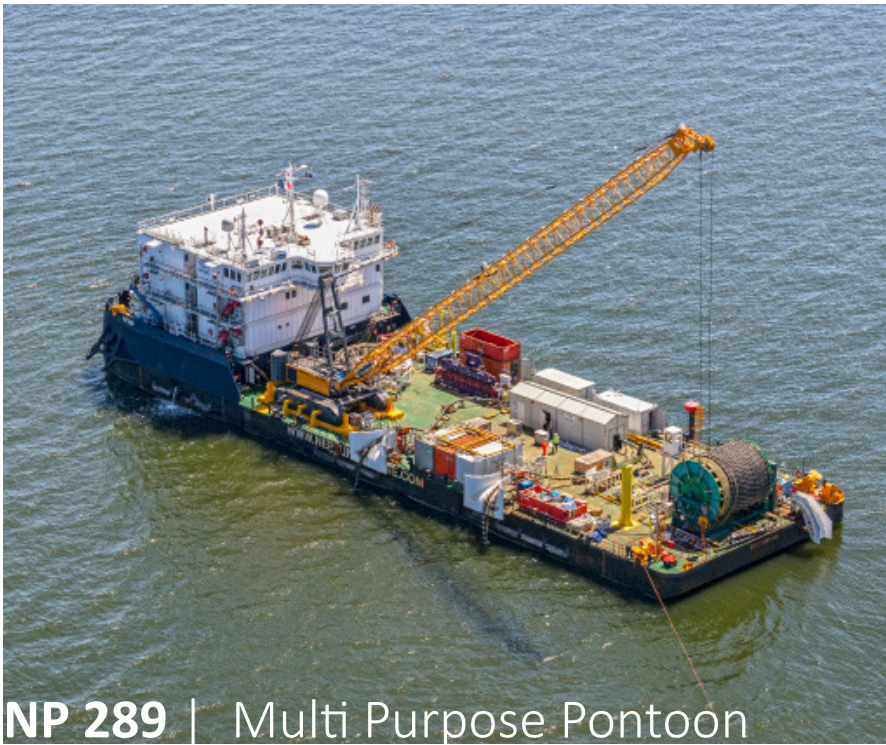
NP 289 | Multi Purpose Pontoon

This multi purpose pontoon can be equipped to fulfill a broad range of operations. The free deck space in combination with the large accommodation offers many possibilities for all kinds of operations including salvage, offshore accommodation and renewables support.