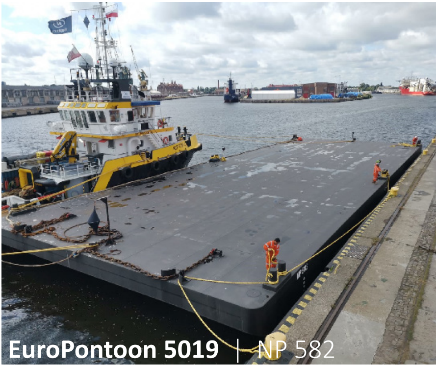
EuroPontoon 5019 | NP 582