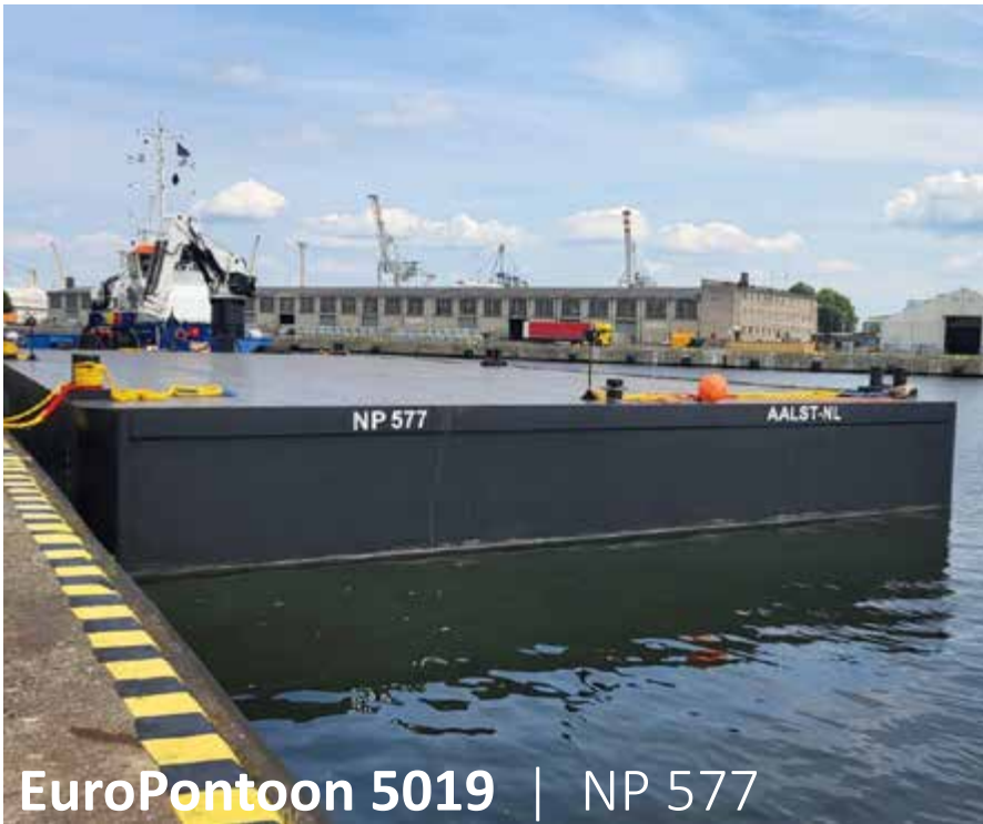
EuroPontoon 5019 | NP 577

Neptune has got various vessels and pontoons available for sale or charter. To fulfil your operational demands, Neptune offers a wide range of deck equipment, including accommodation units, mooring equipment and cranes.