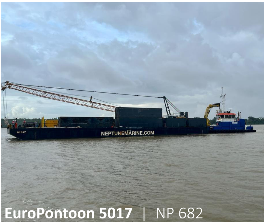
EuroPontoon 5017 | NP 682

Neptune has got various vessels and pontoons available for sale or charter. To fulfil your operational demands, Neptune offers a wide range of deck equipment, including accommodation units, mooring equipment and cranes.