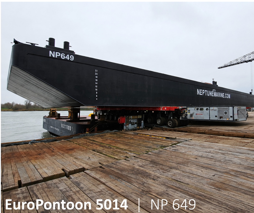
EuroPontoon 5014 | NP 649

Neptune has got various vessels and pontoons available for sale or charter. To fulfil your operational demands, Neptune offers a wide range of deck equipment, including accommodation units, mooring equipment and cranes.