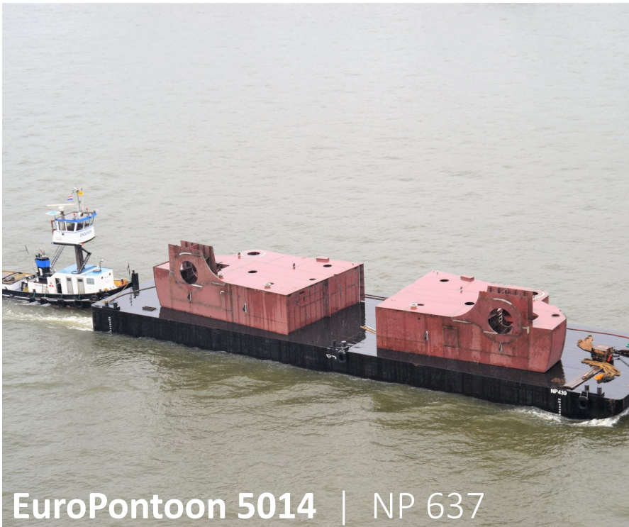
EuroPontoon 5014 | NP 637

Neptune has got various vessels and pontoons available for sale or charter. To fulfil your operational demands, Neptune offers a wide range of deck equipment, including accommodation units, mooring equipment and cranes.