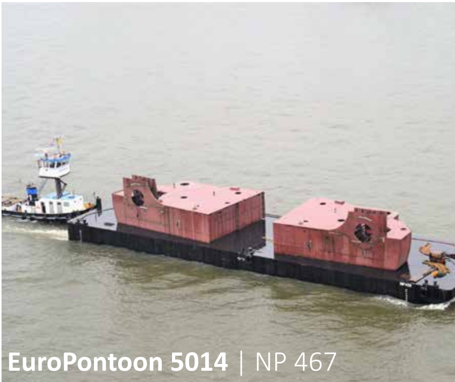
EuroPontoon 5014 | NP 467

Neptune has got various vessels and pontoons available for sale or charter. To fulfil your operational demands, Neptune offers a wide range of deck equipment, including accommodation units, mooring equipment and cranes.