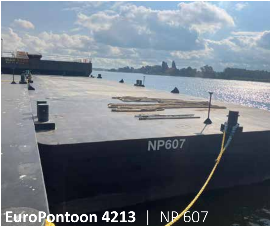
EuroPontoon 4213 | NP 607

Neptune has got various vessels and pontoons available for sale or charter. To fulfil your operational demands, Neptune offers a wide range of deck equipment, including accommodation units, mooring equipment and cranes.