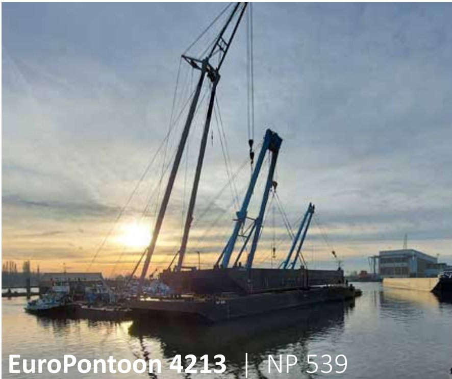
EuroPontoon 4213 | NP 539

Neptune has got various vessels and pontoons available for sale or charter. To fulfil your operational demands, Neptune offers a wide range of deck equipment, including accommodation units, mooring equipment and cranes.