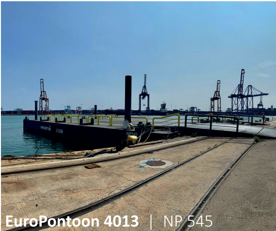
EuroPontoon 4013 | NP 545

Neptune has got various vessels and pontoons available for sale or charter. To fulfil your operational demands, Neptune offers a wide range of deck equipment, including accommodation units, mooring equipment and cranes.