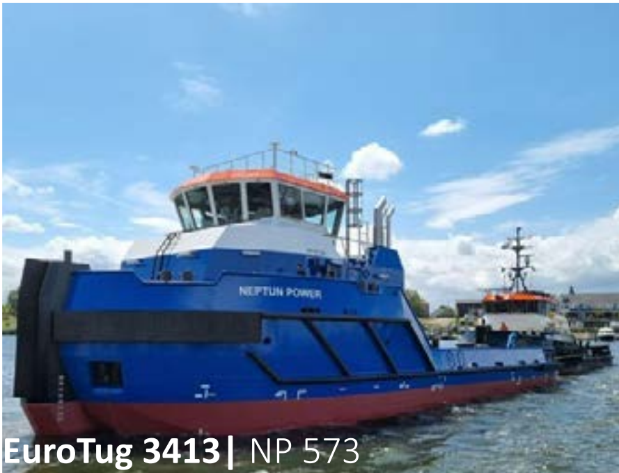
EuroTug 3413 | NP 573

The robust, efficient and flexible design of the AH Tug makes it one of the best vessels for anchor handling, dredging support and long distance towages. The AH Tug can be adapted to perfectly fit any project within a short time.