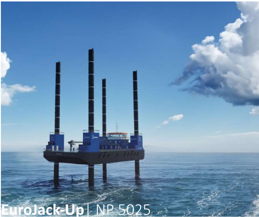
EuroJack-Up | NP 5025

The EuroJack-Up is a multi-purpose jack-up barge design, which offers solutions to all kinds of maritime operations such as offshore construction. It can be modified to fit your demands. This could either be the installation of propulsion, or the installation of a heavy lift crane to fit your project