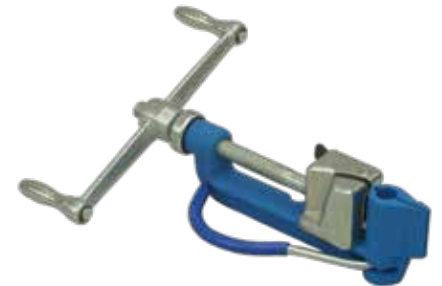
C001 BAND-IT Tool (for Uncoated)