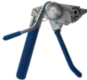
C075 Bantam Tool (for PPA Coated)