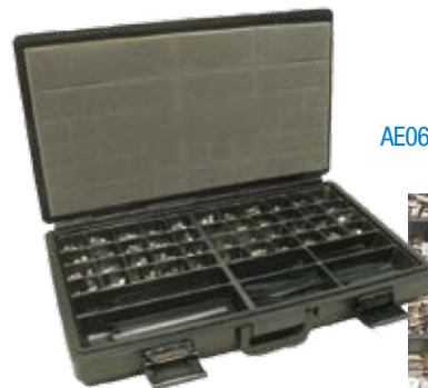
AE060 Easy-Read Kit